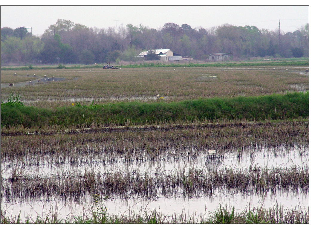
Figure 3. Typical rice field/crawfish pond found in south central Louisiana. Notice the large leveled fields with little to no slope and low, minimum levees. For reference of water depth, crawfish traps are approximately 22 inches tall.

Aeration (at water inlets to the pond) and fish exclusion devices (at surface water inlets and outlets) should be