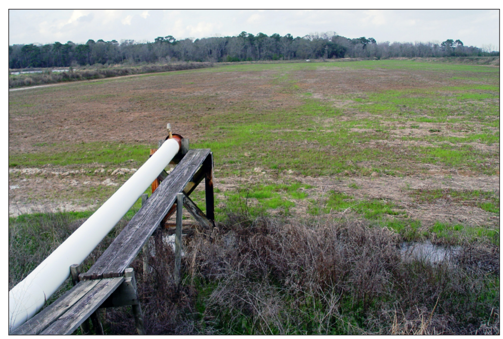
Figure 1. One of several abandoned catfish ponds on this farm that have been laser leveled and readied for conversion to a crawfish pond.

used to shape the pond bottom as desired, moving large volumes of soil may not be recommended. Removing top soil from large hills during severe leveling operations will sometimes limit forage establishment in those areas, and deep fills within the pond floor will often cause soft spots that could hinder subsequent equipment traffic. Locations that require minimal leveling are preferred.